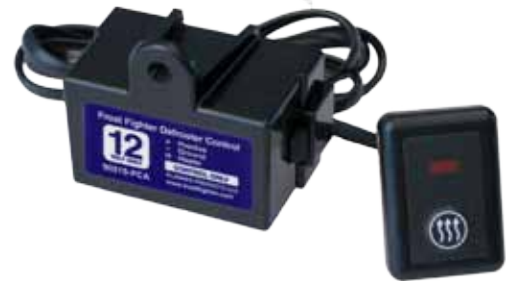
ThermaSync Timing Defroster Control and Switch