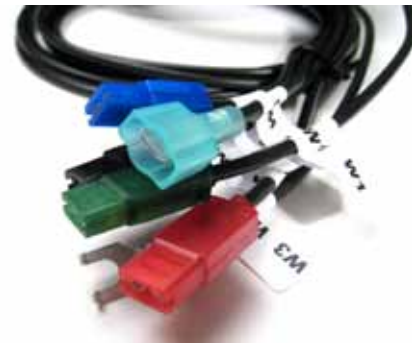
Installation pack connectors